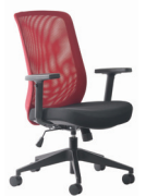
MESH BACK Red