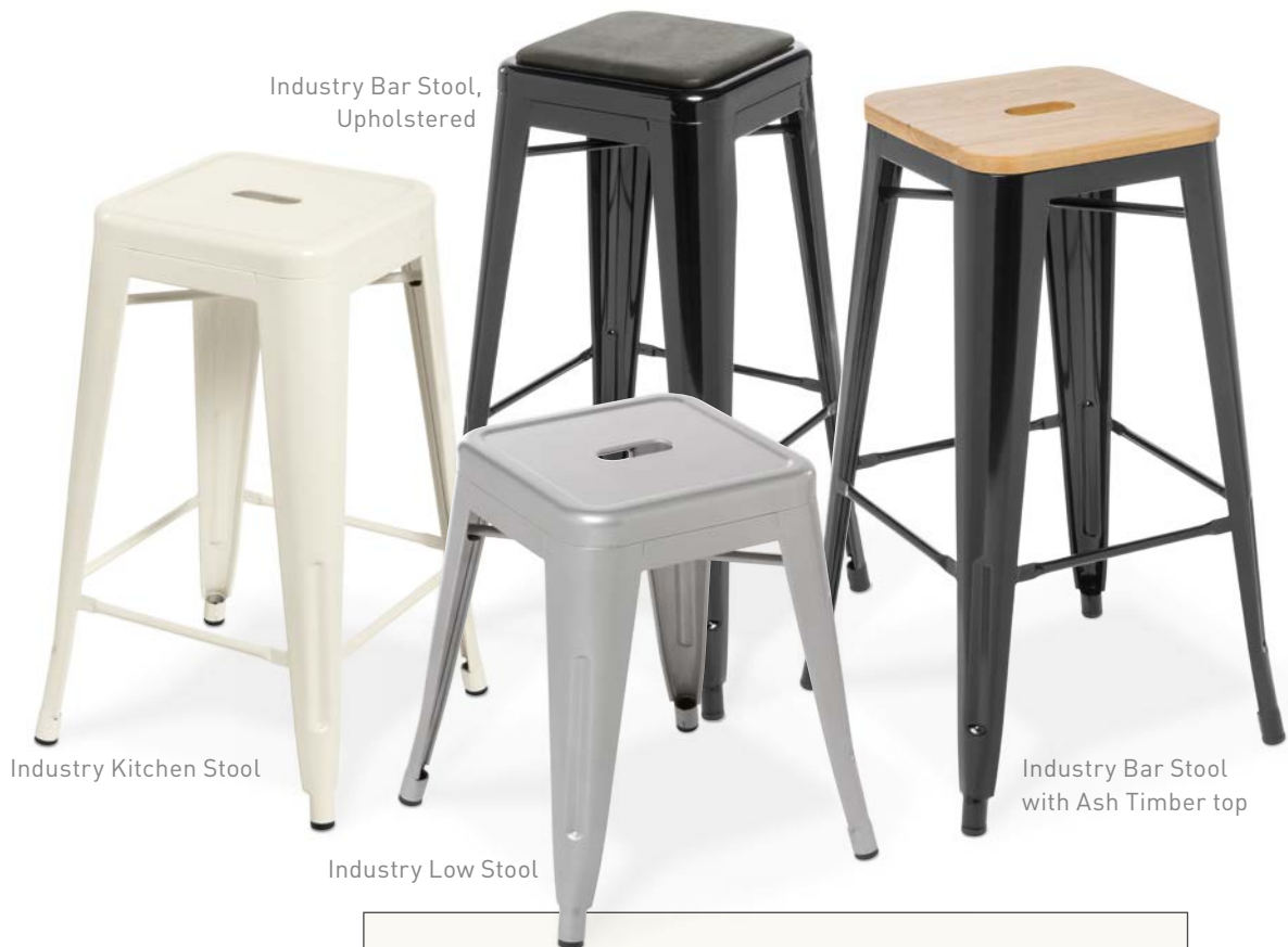
Industry Bar Stool, Upholstered